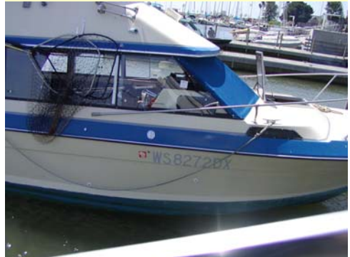
The Karma as she prepares to tie up alongside the R & R in the calm waters of the Sheboygan Harbor.

served as Coxswain. After arriving on scene, the team talked with the boater, then passed him the towing line. The R & R took the Karma under tow in 4 foot seas. They towed the Karma back to the Sheboygan Harbor, where they took the Karma alongside and completed towing the disabled vessel to the boat ramps. The boat owner had made some calls while being towed and had new batteries waiting for him on the pier. Once the Karma was safely tied up at the boat ramp, the