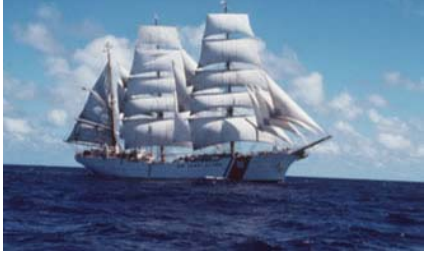
Length: 295'; Beam: 39' 1"; Draft: 17' 6" full load Displacement: 1,784 tons full load.

The Eagle is a three-masted sailing barque with 21,350 square feet of sail. It is the only active commissioned sailing vessel in the U.S. maritime services. It was commissioned in 1936 by the German Navy. As a prize of WWII it was re-commissioned on 15 May 1946 by the U.S.