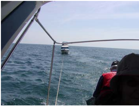
The crew of the R & R crew keeps a close watch on the towline to the distressed vessel Karma during the five mile tow to Sheboygan .